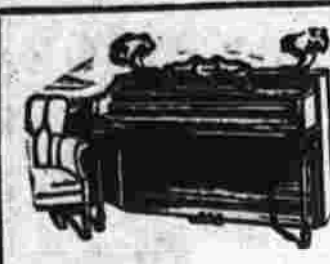
Manchester's Piano Distributor for